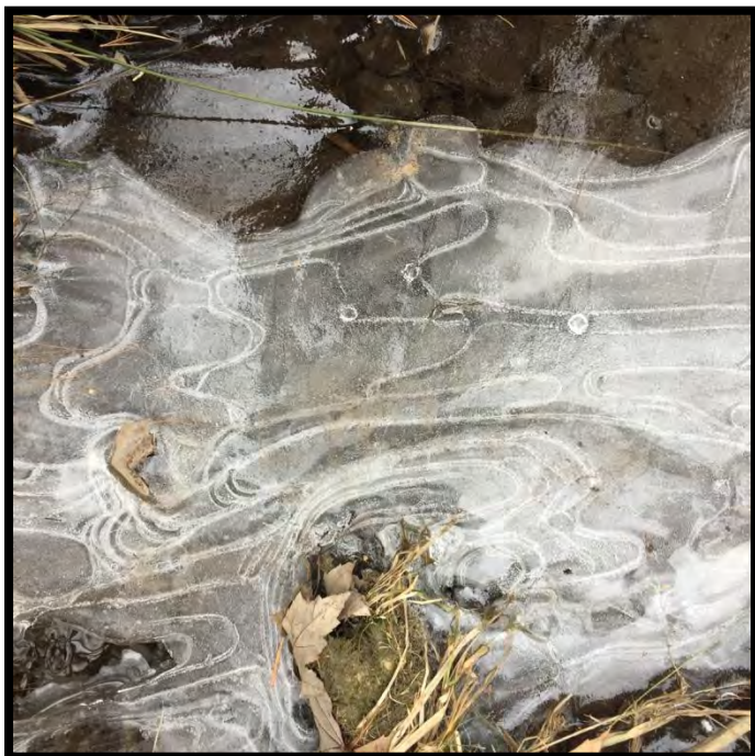
"Ice 1" by Cyd Gorman